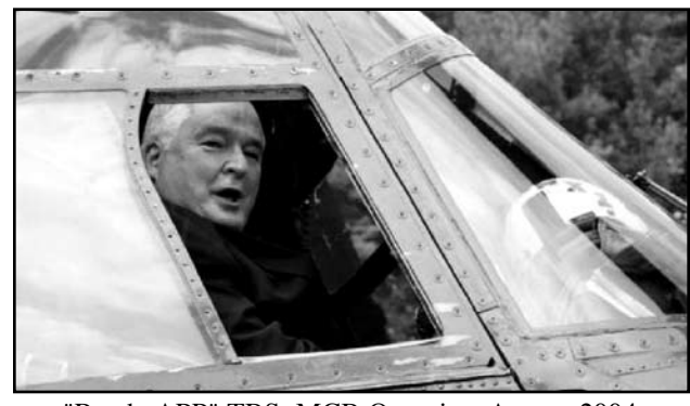
"Ready APP" TBS MCB Quantico, August 2004

1977- Inactive Reserves.10/86 Honorable Discharge.