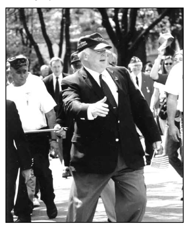
Team from mountains west of An Hoa Chicago Memorial Day – Grand Marshall Beverly Hills – Morgan Park 27 May 2002